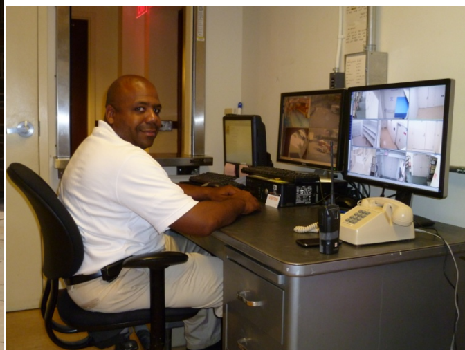
Firestone Library Security Officers