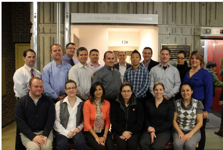
Featured above are the Management, Administrative and Technical Team of McGill Security Services.